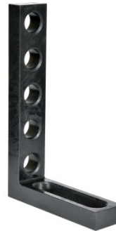
W08325 Right Angle Bracket / Stop