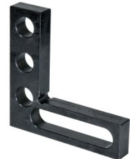
W08330 L Bracket