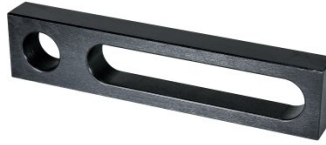
W08342 Straight Bar Stop