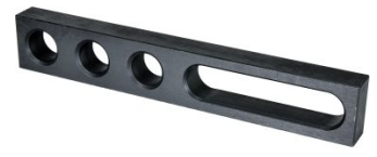
W08343 Straight Bar Stop