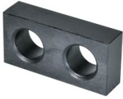
W08340 Straight Bar Stop