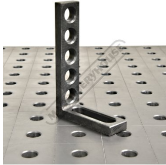
Shown on Welding Table