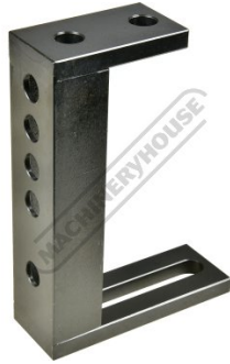
Clamping Square 200mm