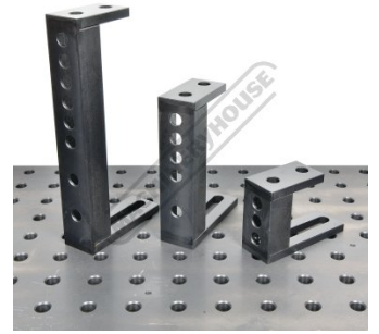
100mm 200mm 300mm Range Available