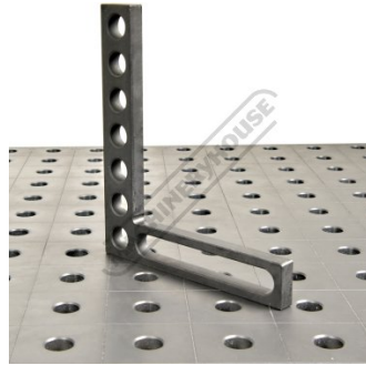
Shown on Welding Table