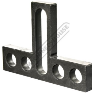
T Bracket 130 x 90 x 30mm