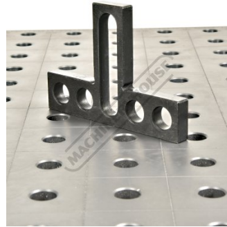
Shown on Welding Table