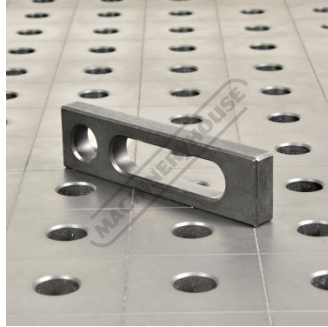
Shown on Welding Table