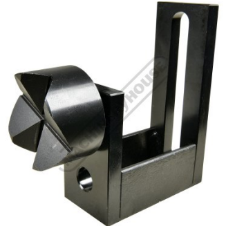
Shown Setup on Optional Riser