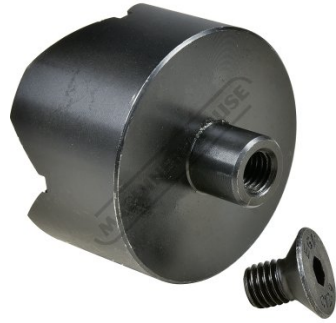
16mm Diameter Shank