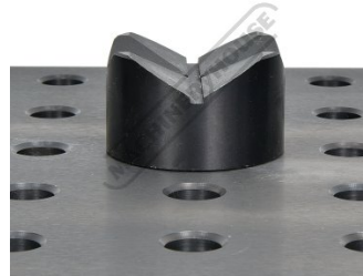
Shown on Welding Table