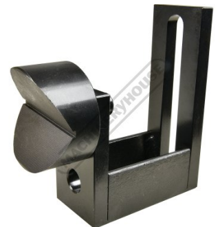
Shown Setup with Optional Riser