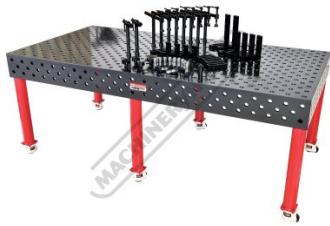
Shown on M28 Pro Series Welding Table