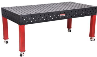
W08257 2400 x 1200mm M28 Pro Series Welding Table