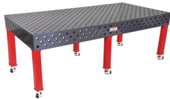
W08260 3000 x 1500mm M28 Pro Series Welding Table