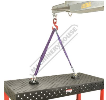
Shown using optional lifting kit