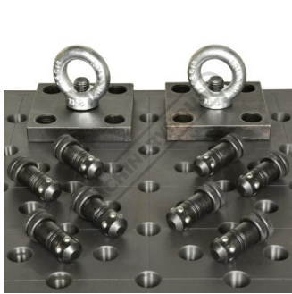
Table-accessory lifting kit