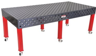
W08260 3000 x 1500mm M28 Pro Series Welding Table