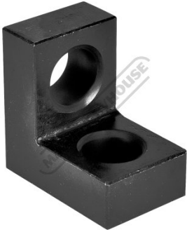
75x75x50mm Angle Bracket