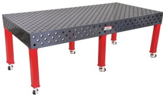
W08260 3000 x 1500mm M28 Pro Series Welding Table