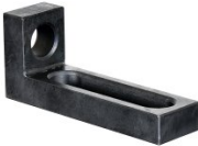
W08321 Right Angle Bracket / Stop