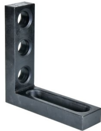
W08324 Right Angle Bracket / Stop