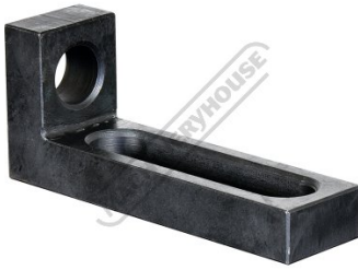
175x75x50mm Angle Bracket