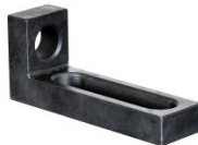
W08321 Right Angle Bracket / Stop