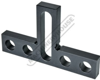
250x150x25mm T Brackets