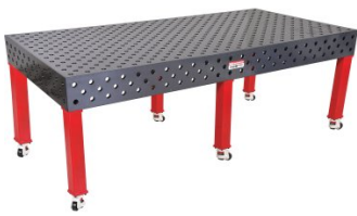
W08260 3000 x 1500mm M28 Pro Series Welding Table