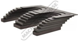
Shim Thickness Comparison