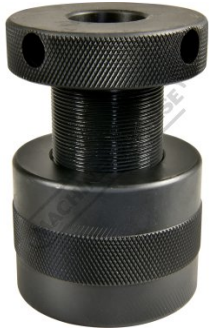
Height Adjustment Device