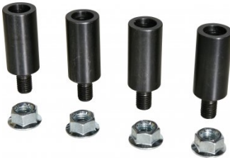
W08516 50mm x M12 Multi-Purpose Riser/Stops (Threaded) - 4pc Pack