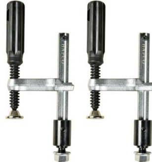
W08510 Weld Clamps with Locking Nuts (2 Piece Pack)