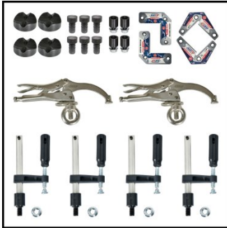
W08495 24pc Starter Welding Table Clamp Kit