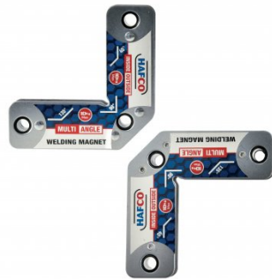
W1081 Multi Angle Corner Magnets - 2pc Pack