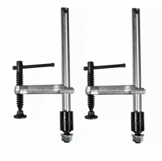
W08511 Weld Clamps with Locking Nuts (2 Piece Pack)