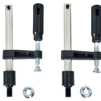
W08509 Weld Clamps with Locking Nuts (2 Piece Pack)