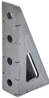
W08532 Welding Table Square