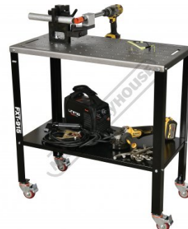
Shown Setup as a Work Bench (Accessories not included)