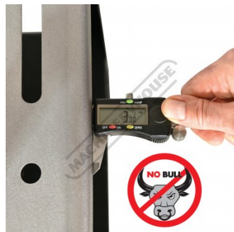
3mm Thick Bench Top