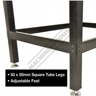
Steel Leg Bracing with Adjustable Feet