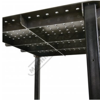
Rib Design for Strength