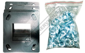
Includes Base Plate Kit for Optional Castor Wheels