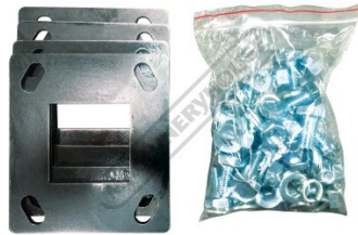
Includes Base Plate Kit for Optional Castor Wheels