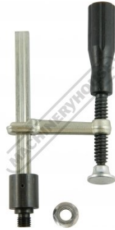
4 x Clamp