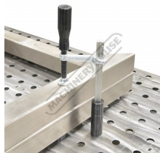
Shown Screwed into Threaded Riser