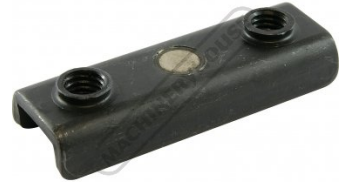
4 x Threaded Magnetic Adaptor