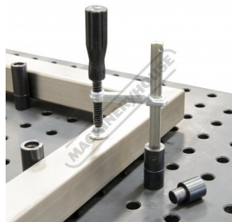
Shown Screwed into Optional Adaptor View2