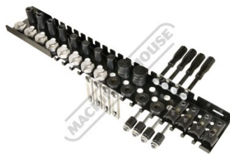
Shown on Optional Tool Tray (W08524)