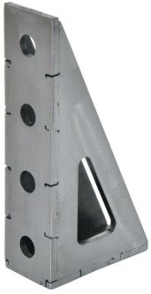
W08532 Welding Table Square