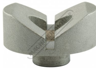
8 x V Block