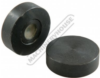
8 x Magnetic Rest