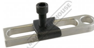
4 x Stop Bar Assembled