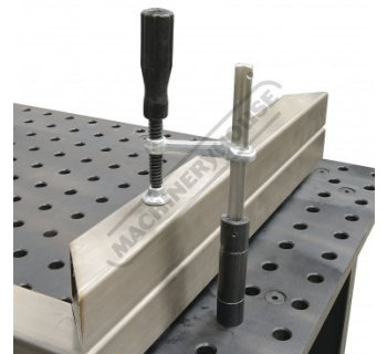
Shown Screwed into Threaded Riser with Optional Adaptor