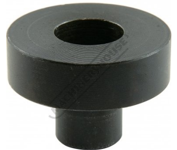
4 x V Spacer