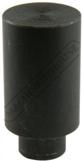
4 x Insert Stop