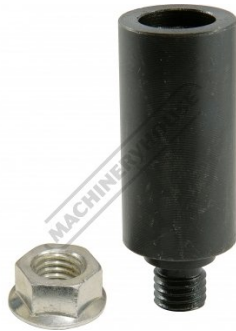
4 x Positioning Stop