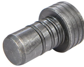
3 x O Rings