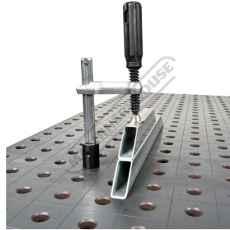
Shown Clamping 2 Pieces of Rectangular Tube