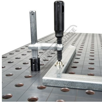
Shown Clamping Rectangular Tube