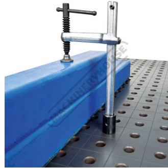
Shown Clamping 2 Lengths of Square Tube