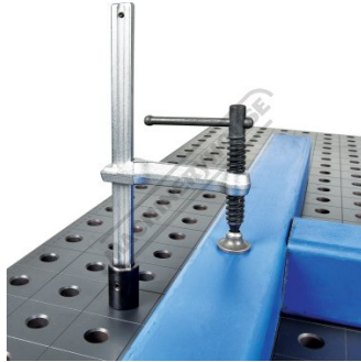
Shown Clamping Square Tube