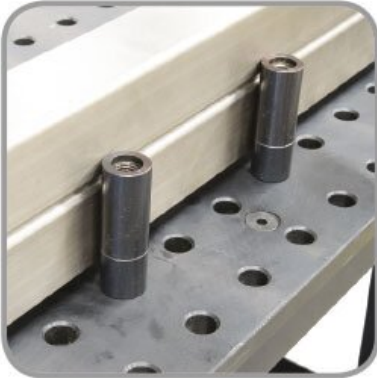
Optional Risers (W08515) screw directly into Adaptors for increased height.