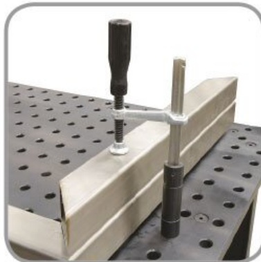
Optional SC-60 Clamps (W08510) & Risers (W08515) screw directly into adaptors for increased clamp height.