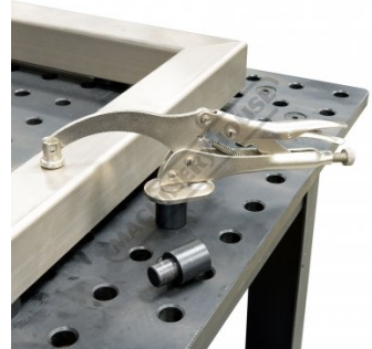
Optional Clamp C103 shown screwed into Threaded Riser