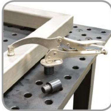
Optional Clamps (C103) screws into adaptors for quick position clamping.