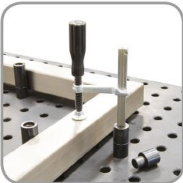
Optional SC-60 Clamps (W08510) screw directly into adaptors for quick position clamping.