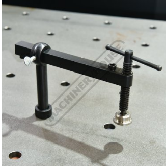
Shown on Welding Table