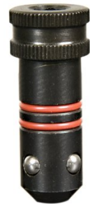
W07892 Ball Lock Pin 16 x 28mm