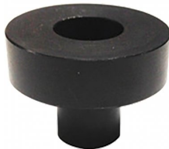
W08012 BuildPro V-Block Spacer