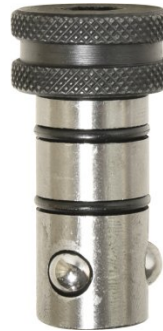
W07891 Ball Lock Pin 16 x 24mm