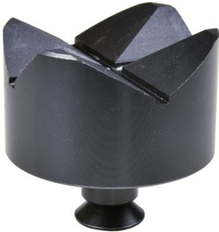
W07880 Cross Type 90 / 120° V-Pad