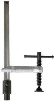
W07830 Welding Table Clamp