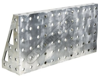
Set up as a Welding Table Square Rear View