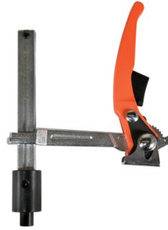
W07834 Ratchet Welding Table Clamp