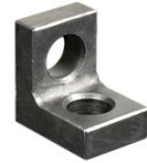
W07840 Right Angle Bracket / Stop