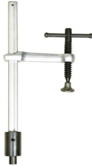
W07832 Welding Table Clamp