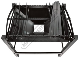
Pull Out Disposable Ribs