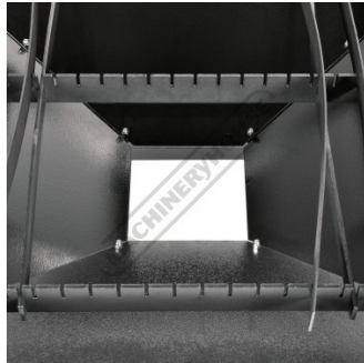
Dust Waste Chute