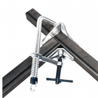
W1019 Corner Clamp