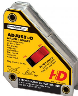
W1007 Adjust-O Magnet Square - Heavy Duty