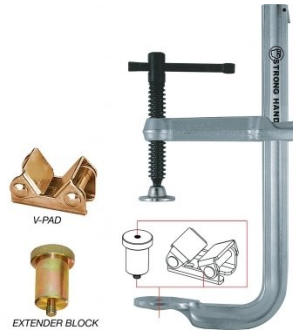
W1025 4 In One Utility Clamping System