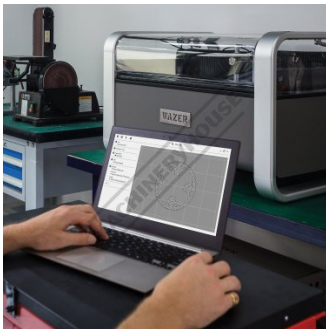
Web Base Software