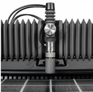
Cutting Head Inside Front View