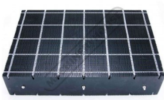
Single Cut Bed