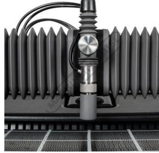
Cutting Head Inside Front View