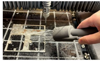
Wazer Pro Water Nozzle