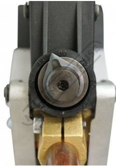
Clamp Force Adjustment