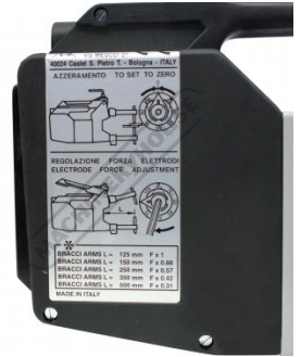
Force Adjustment Chart