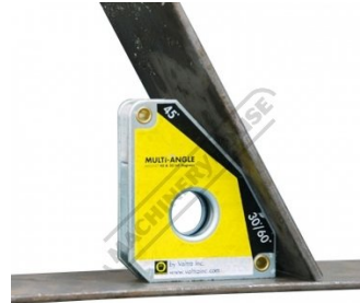
Shown In Use 30 Degree