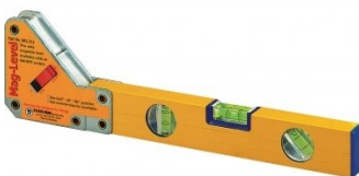
W1020 Magnetic Level