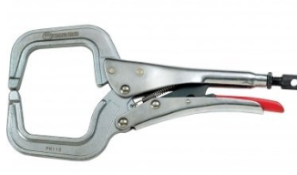
W1016 Locking C-Clamp - Round Tip