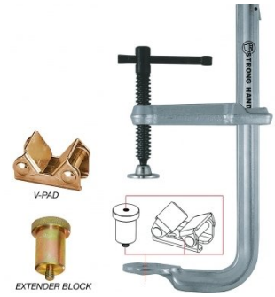
W1026 4 In One Utility Clamping System