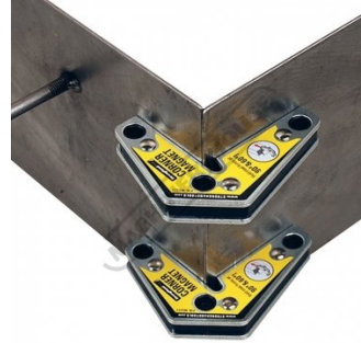
Shown In Use 2