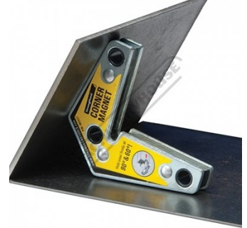
Shown In Use 3