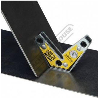
Shown In Use 4