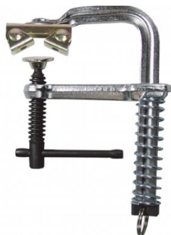
W07970 BuildPro Magspring Clamp