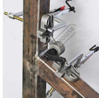
Shown Clamping RHS Steel At Angle