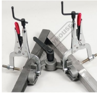
Shown Clamping RHS Steel