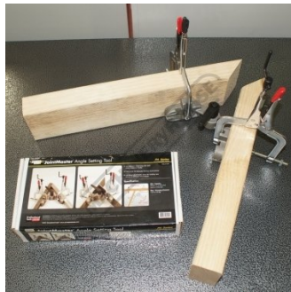
Shown Clamping Wood Swiveling Open