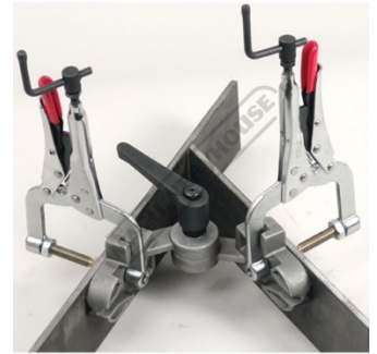
Shown Clamping Flat Steel At Angle