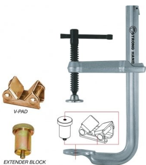
W1028 4 In One Utility Clamping System