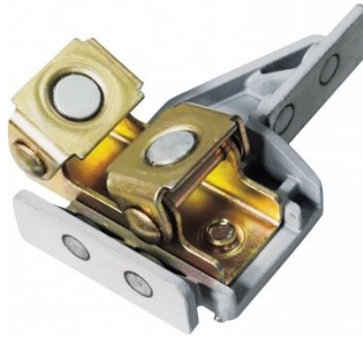
W1023 MagTab AL Magnet