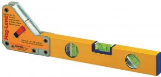
W1020 Magnetic Level