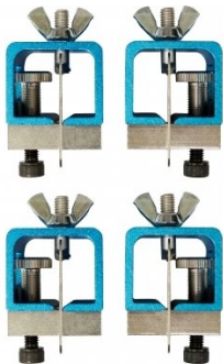
W113 Butt Welding Aluminium & Steel Clamp Set