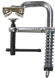
W07970 BuildPro Magspring Clamp