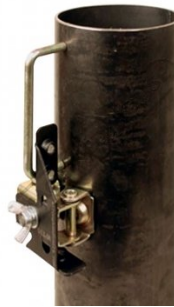
Positioning Handle On Pipe