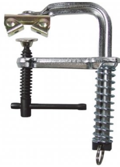
W07970 BuildPro Magspring Clamp