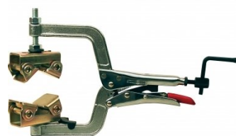
W1015 Pipe Plier