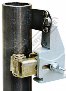
Offset Mounting On Pipe