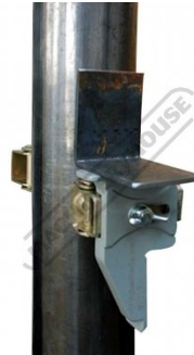
Angle Iron On Pipe