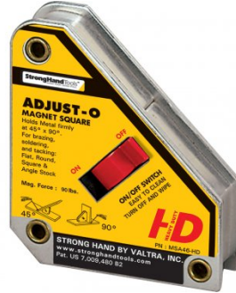
W1007 Adjust-O Magnet Square - Heavy Duty