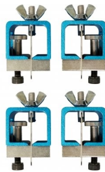
W113 Butt Welding Aluminium & Steel Clamp Set