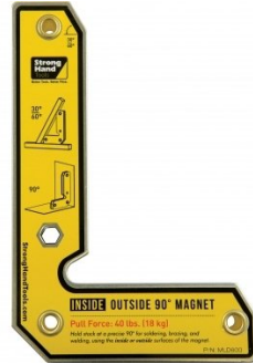
W1032 Fixed Angle Inside / Outside Angle Magnets