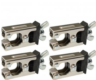
W112 Micro Welding Steel Clamp Set