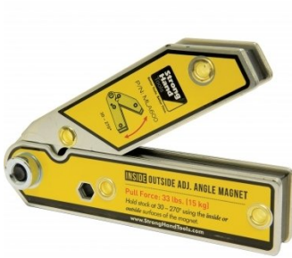
W1031 Adjustable Inside / Outside Angle Magnets