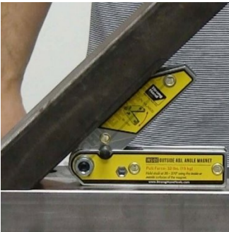
Shown in Use