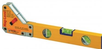
W1020 Magnetic Level