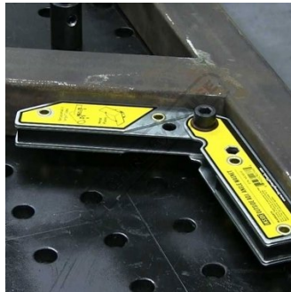
Shown in Use 2