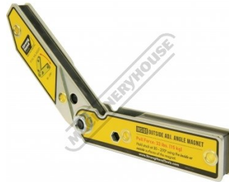
Open at Any Angle