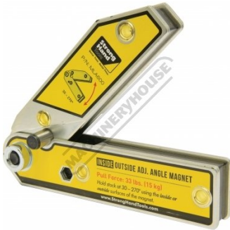
Set at 45 Degrees