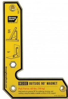
W1032 Fixed Angle Inside / Outside Angle Magnets