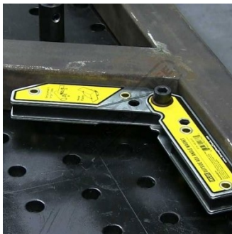
Shown in Use 2