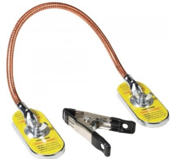
W1005 Snake Magnet & Spring Clamp