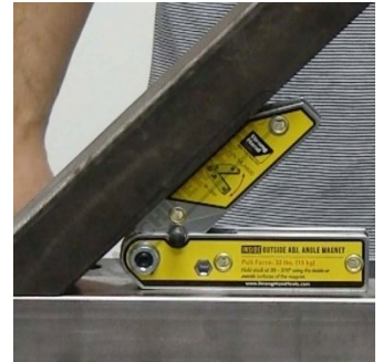
Shown in Use