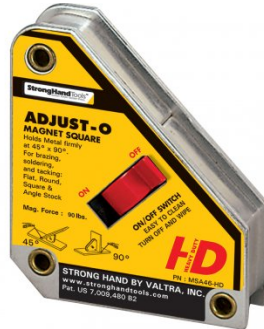
W1007 Adjust-O Magnet Square - Heavy Duty