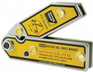
W1030 Adjustable Inside / Outside Angle Magnets