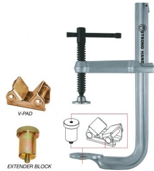
W1026 4 In One Utility Clamping System