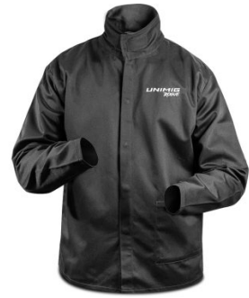
W1003 Rogue Welding Jacket