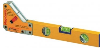
W1020 Magnetic Level