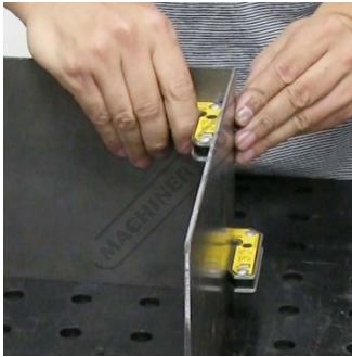
Shown in Use 2