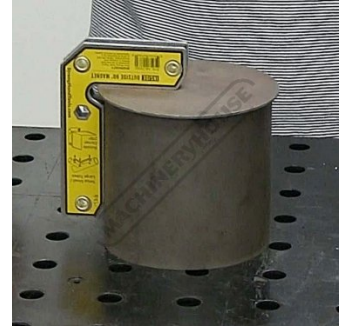
Shown in Use