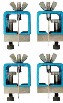
W113 Butt Welding Aluminium & Steel Clamp Set