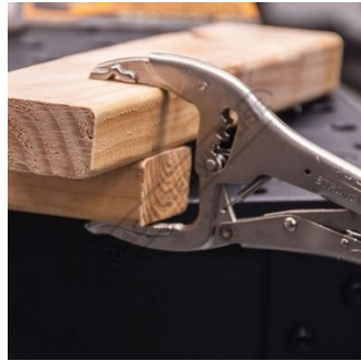
Clamp two 2x4 studs