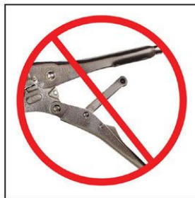
Secure Adjustment Bar minimizes bar pop-outs.