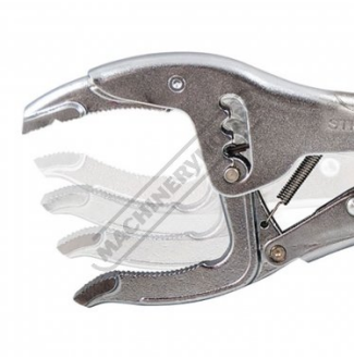
4 Adjustments Slots