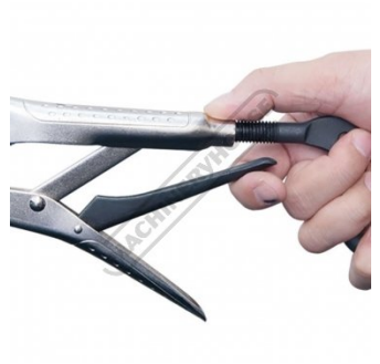
Quick Release Trigger