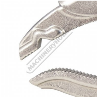
V Notch on top jaw for small parts