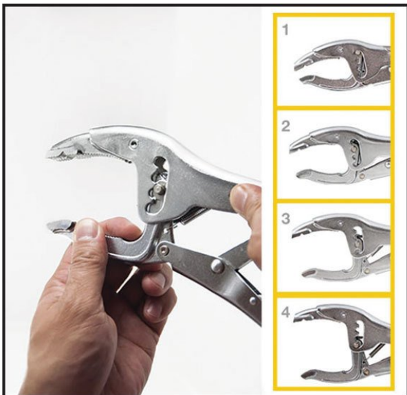
Move lower jaw into one of four notches to set desired jaw opening.