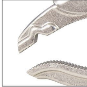
V-Notch on top jaw for small parts (As small as 1/4").