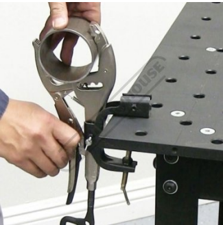
Big Mouth Pliers for holding tube and pipe