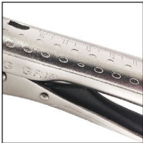
Non-Slip grip marks on top and bottom jaws for positive gripping.