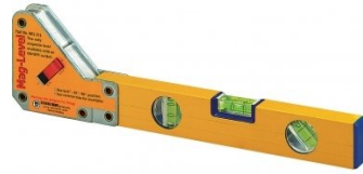
W1020 Magnetic Level