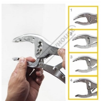
Move lower jaw into one of four notches to set desired jaw opening