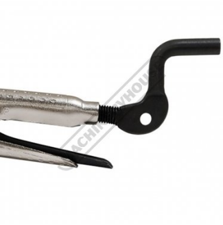
Unique crank handle for fast easy jaw opening and pressure adjustment