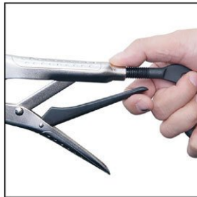
Quick release trigger.