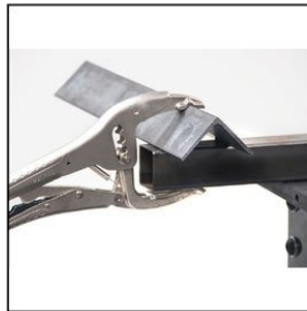
Big Mouth Pliers