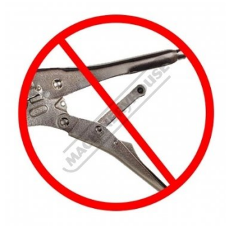
Secure Adjustment Bar minimizes bar pop outs