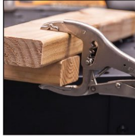
Clamp two 2 x 4 studs