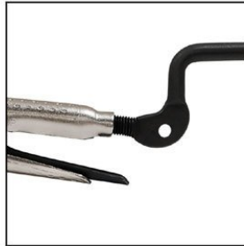
Unique crank handle for fast, easy jaw opening and pressure adjustment.