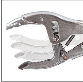
Four Adjustment Slots