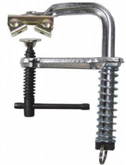
W07970 BuildPro Magspring Clamp