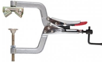
W07990 BuildPro Round Stock Plier