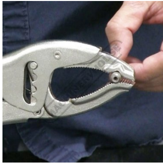
V Notch for small parts