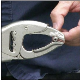
V-Notch for small parts.