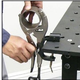
Big Mouth Pliers