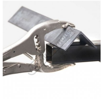
Big Mouth Pliers for holding angle