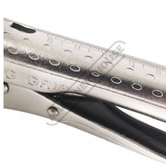
Non Slip grip marks on top and bottom jaws for positive gripping