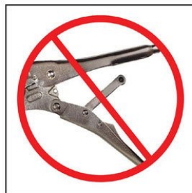
Secure Adjustment Bar minimizes bar pop-outs.

Minimal handle spread, even at the maximum opening, make these Pliers easier to grasp, lock, and release.