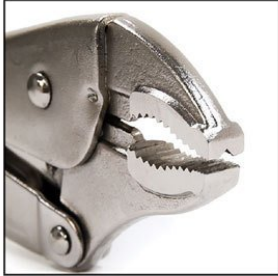
V-Groove on top jaw