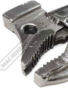
M10 Threaded hole for mounting grounding lug