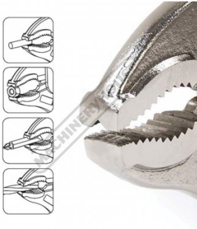
V Groove on top jaw for holding small parts