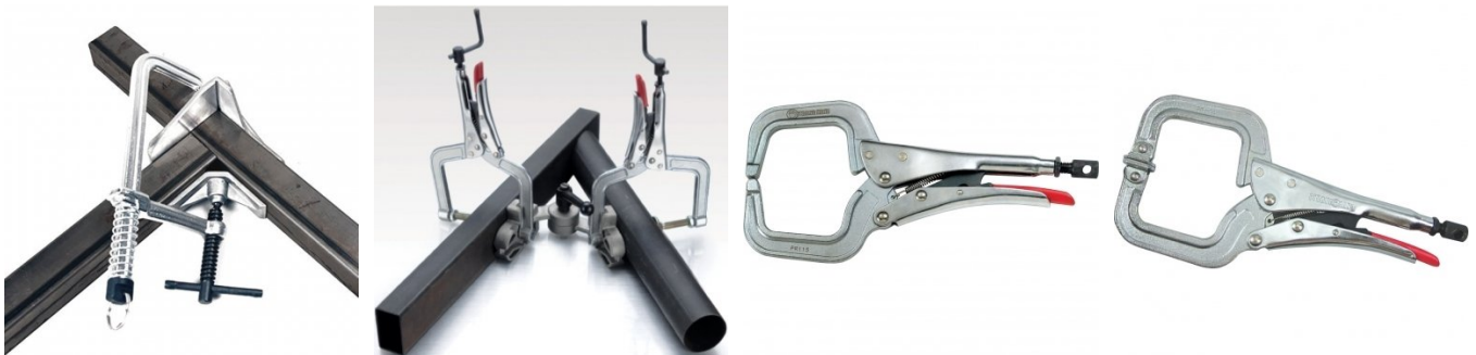
W1017 Locking C-Clamp - Swivel Tip