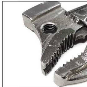
M10 Threaded hole for mounting grounding lug.