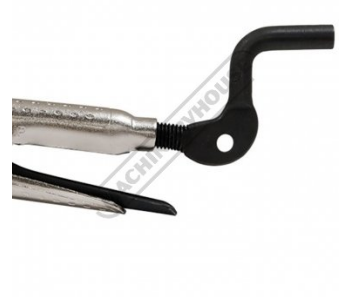
Unique crank handle for fast easy jaw opening and pressure adjustment