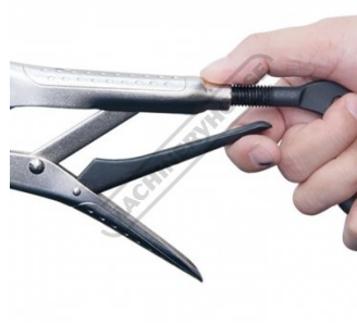
Quick release trigger