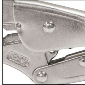
Cr-V Brazed Jaw for durability