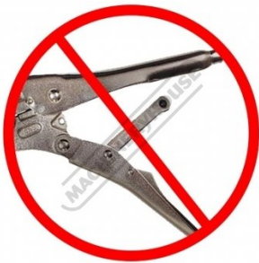
Secure Adjustment Bar minimizes bar pop outs