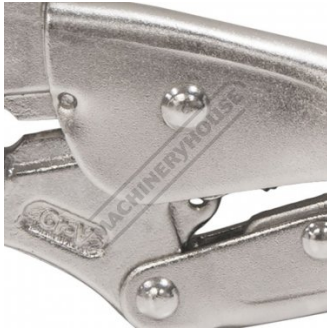
Cr V Brazed Jaw for durability