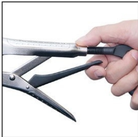
Quick release trigger.