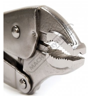
V Groove on top Jaw