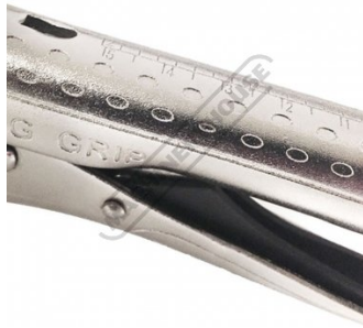
Non Slip grip marks on top and bottom jaws for positive gripping