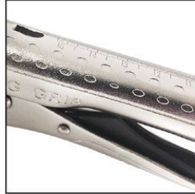
Non-Slip grip marks on top and bottom jaws for positive gripping