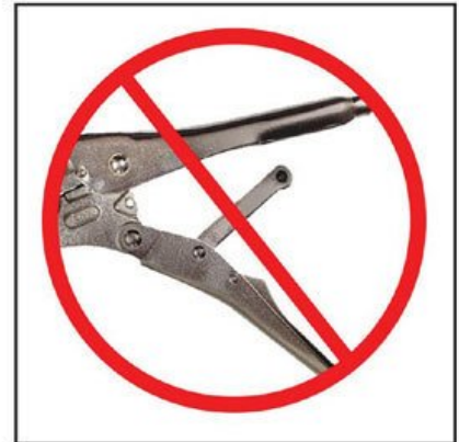
Secure Adjustment Bar minimizes bar pop-outs.