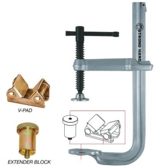
W1025 4 In One Utility Clamping System