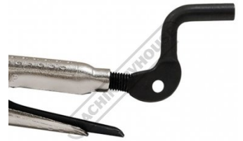
Unique crank handle for fast easy jaw opening and pressure adjustment