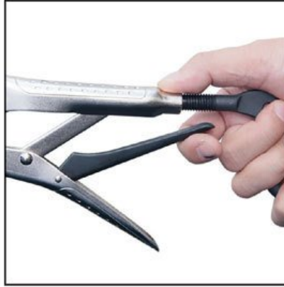
Quick release trigger.