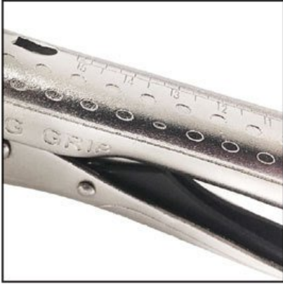
Non-Slip grip marks on top and bottom jaws for positive gripping