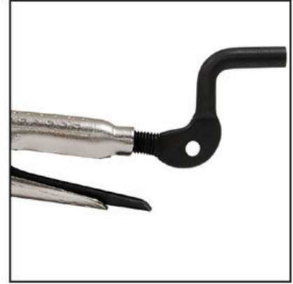
Unique crank handle for fast, easy jaw opening and pressure adjustment.