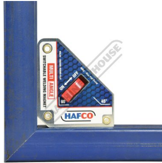
Shown Set Up in 90 Degrees