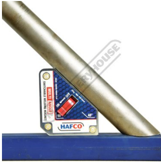
Shown Set Up in 45 Degrees