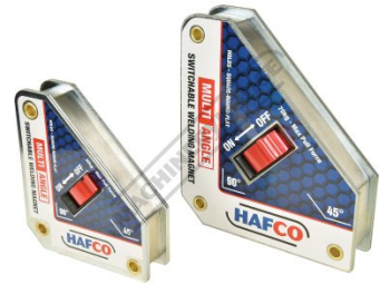
Shown with Optional Larger Mag Switch W1072