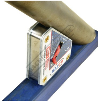
Shown Clamping Round Tube