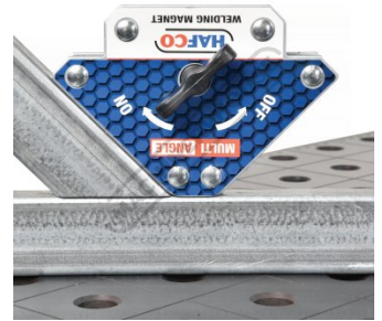
135 Degree Angle