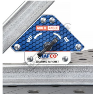
45 Degree Angle