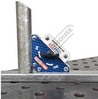
Round Pipe Compatibility