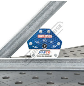
45 Degree Angle