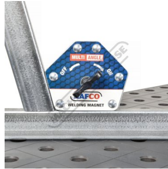
75 Degree Angle