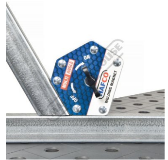
60 Degree Angle