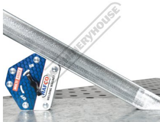
30 Degree Angle