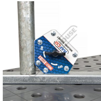
Round Pipe Compatibility