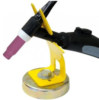
W10361 Magnetic TIG Torch Rest