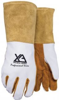
W101 TIG Welding Gloves - 310mm