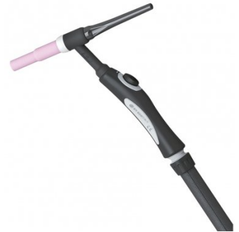
W171A Air Cooled TIG Welding Torch