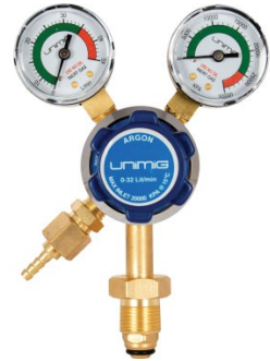
W160A Argon Gas Regulator-Twin Gauge