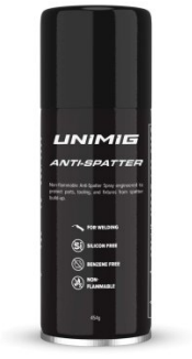
W119 Anti-Spatter Spray