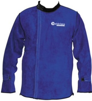
W1002A Professional Promax BL7 Welding Jacket