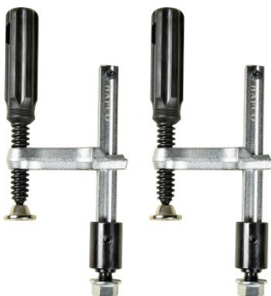
W08510 Weld Clamps with Locking Nuts (2 Piece Pack)