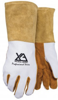
W101 TIG Welding Gloves - 310mm