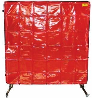
W225 Welding Curtain