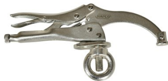
C103 228mm Multi-Purpose Locking Clamp