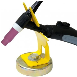
W10361 Magnetic TIG Torch Rest